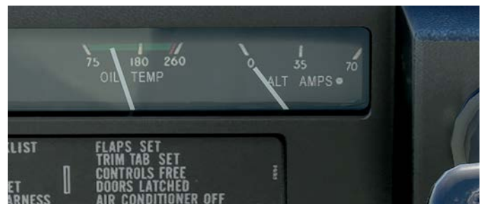
A loadmeter (as in older Pipers like this one) shows the output of the alternator. When the alternator fails, the loadmeter reads zero.

In general, you should expect at least 30-60 minutes assuming a healthy battery and a minimal load. But those are assumptions that can’t be made here. You might not have noticed the failure right away. Your battery may be older than you think. Old or corroded connections can draw more power than